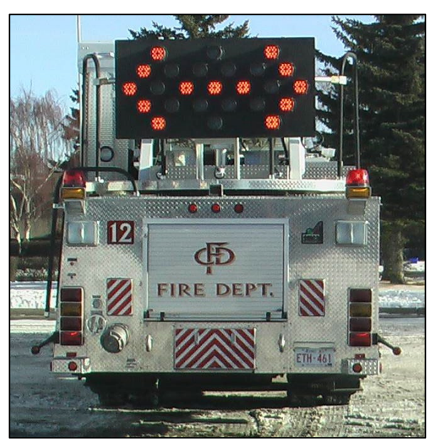
Figure 16: Calgary FD ladder truck with the arrow board on a turntable.

In another innovation, Montgomery County (MD) has placed arrow sticks on the sides of their fire apparatus where the arrow is more visible to traffic as it approaches a unit blocking on an angle.