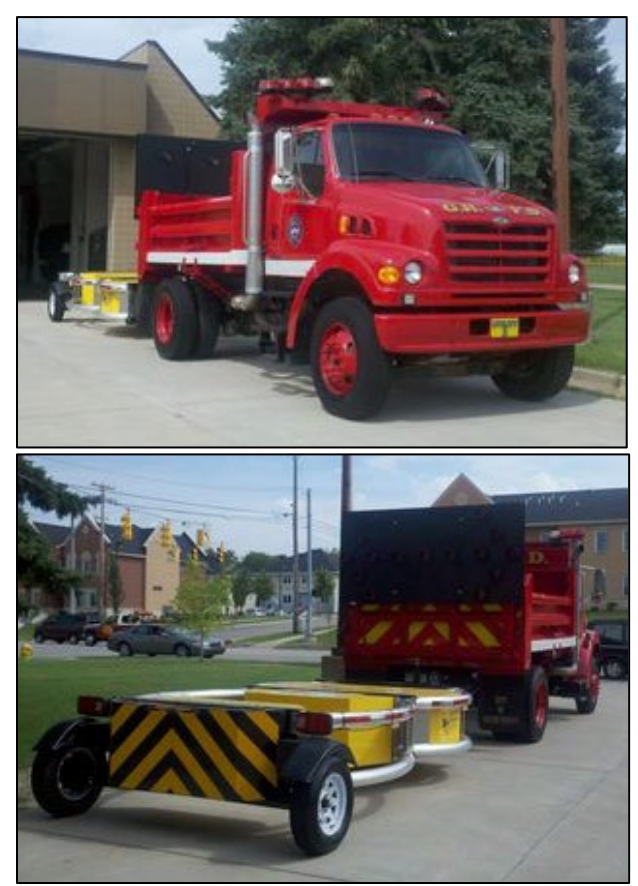
Figure 1: Front and back views of GRFD Utility 2.

Ron Tennant, deputy chief of the Grand Rapids (MI) Fire Department (GRFD), detailed their innovative program that repurposed a public works dump truck into a blocking unit, named "Utility 2." After three incidents over a short period of time in which fire apparatus were struck, approximately $150,000 of repair/replacement expenses incurred, and the damaged units were out of service for an extended period of time, the GRFD, Kent County Road Commission, and the Michigan Department of Transportation (MDOT) came up with the idea to use a dump truck as a blocker instead of an expensive fire apparatus.