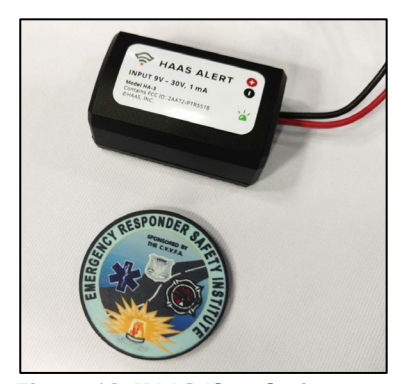
Figure 18: HAAS Alert device, shown with a challenge coin for scale.

The GRFD is also piloting the HAAS Alert mobile responder-to-vehicle (R2V) program. This system uses a small device installed in emergency vehicles that emits a cellular signal. This signal transmits the emergency vehicle's location to the Internet "cloud," which is then accessed by traffic and navigation applications, enabling them to display a warning to users in the area that lets them know responders are enroute or at a particular location or incident scene. The HAAS Alert unit and other digital alerting devices are very cost-efficient and available on the market now with no need for major infrastructure installations.