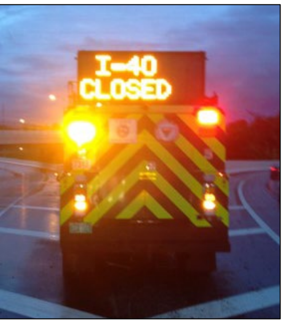
Figure 7: Sample message on a Tennessee Department of Transportation Safety Service Patrol Vehicle.