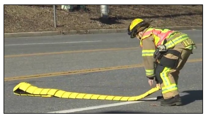
Figure 19: Portable speed bumps (Bloomsburg FD at left; Lynchburg FD at right).