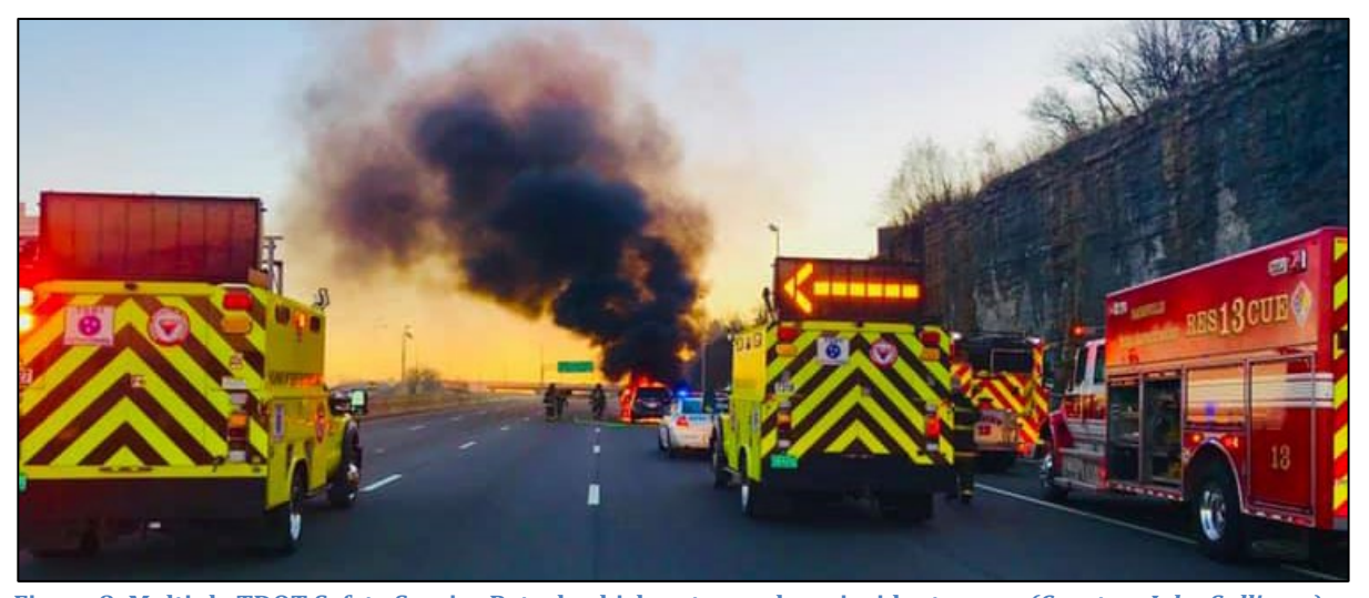
Figure 8: Multiple TDOT Safety Service Patrol vehicles at a roadway incident scene.

These units use short, direct messages on their high-mounted message boards to provide advance warning to the public that they are approaching an incident. The messages use text or text and arrow, with either a pre-programmed or custom message. Messages appear either 12" high (for two-line messages) or 8" high (for three-line messages). TDOT has found that short messages with short words are received best and most accurately. TDOT is also testing "dancing diamonds" and has found them very effective.<sup>3</sup>