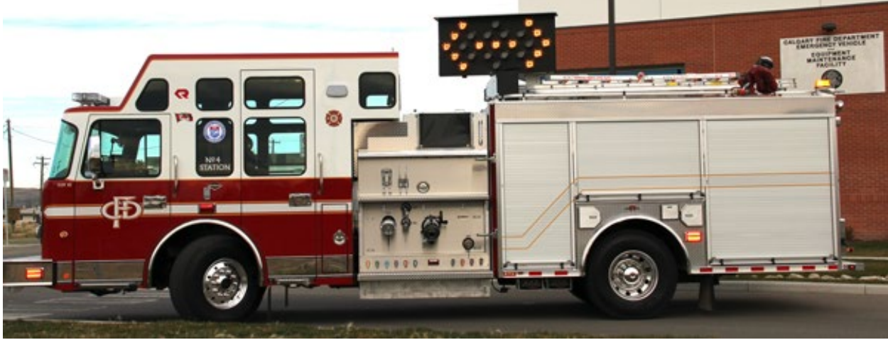
Figure 15: Calgary FD pumper outfitted with a Command Light Arrow Board that can rotate to aim at approaching traffic when parked at an angle.

Also, the group expressed a desire for message and arrow boards to be designed to be rotated so they can be used on vehicles that provide angled blocks. Rotation could be achieved by separate control or by mounting on a ladder truck turntable, as the Calgary (Canada) Fire Department has done. Finally, the group agreed that the commonly used four-corner light pattern on arrow boards is not as effective at getting drivers' attention as the dancing diamonds flash pattern.