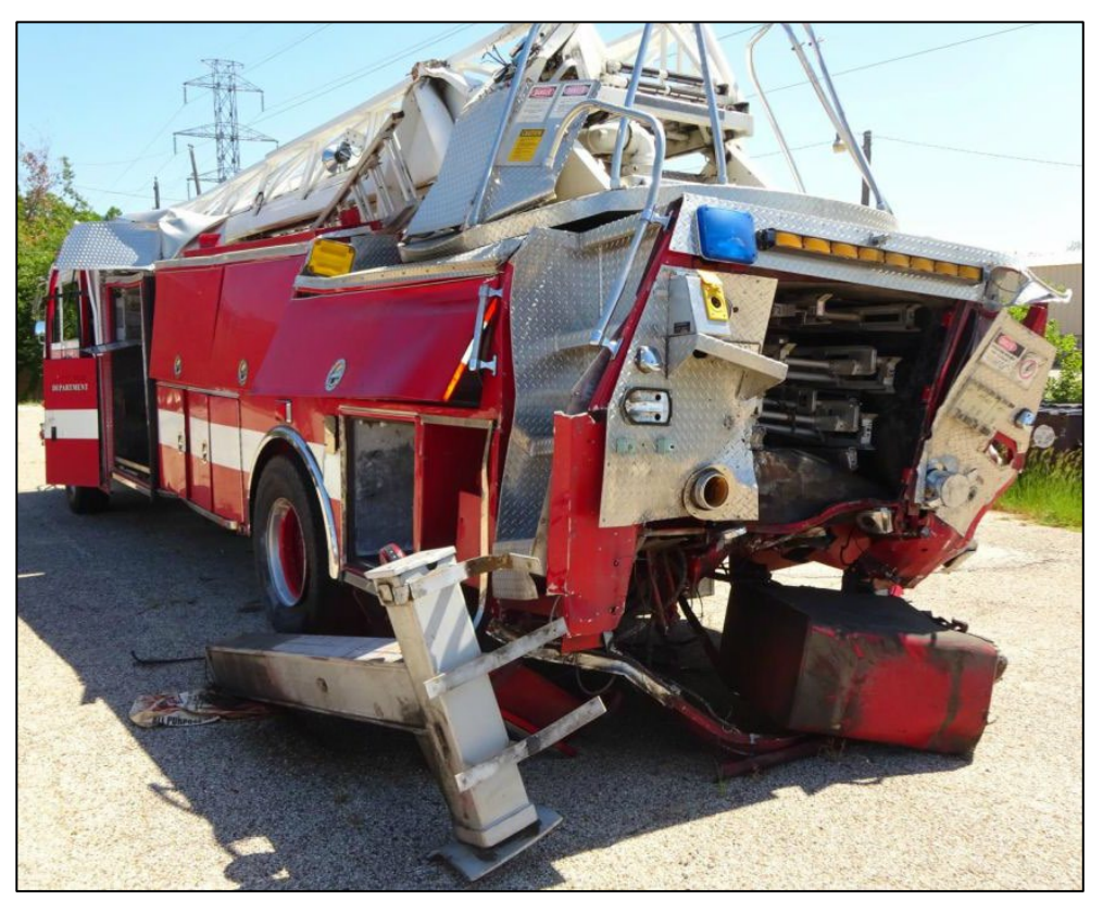
Figure 2: Irving FD Ladder 52 after being struck in July 2015.

This wasn't the only incident. Over a five-year period, nine Irving apparatus were struck while blocking at roadway incidents. Two of those vehicles, including Ladder 52, were totaled. The total time out of service for all the damaged apparatus was 2,018 days (more than 5.5 years), which forced the department to operate with reserve equipment. Repair and replacement of these apparatus cost the department $1.5 million plus medical expenses for the injured firefighters.