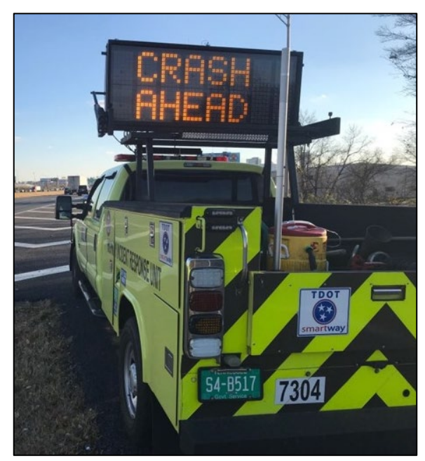
Figure 6: Sample message on a Tennessee Department of Transportation Safety Service Patrol Vehicle.