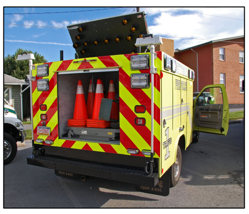
Figure 11. Gettysburg (PA) Fire Police unit.