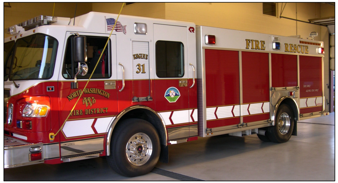
Figure 21: North Washington (CO) FPD engine with white side stripe shaped like an arrow to indicate which direction traffic should flow around a block. Courtesy of North Washington (CO) Fire Protection District. )