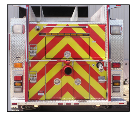
Figure 12: Horry County (SC) fire unit with a small, traditional arrow stick on the rear panel. Minimal level of effectiveness.

The group agreed that small arrow devices (i.e. arrow sticks) are not as effective and that departments should purchase as large an arrow or message board as possible. Also, the group agreed that arrow or message boards should be mounted as high up on the vehicle as possible, even above the hose bed on a fire apparatus. Finally, the consensus was that an arrow device on fire apparatus should be programmed to shut off when the vehicle is in motion so people are not confused about its use as a traffic control device. It was felt that the arrow sticks should only be used when directing traffic, otherwise the effect of grabbing driver attention is ruined.