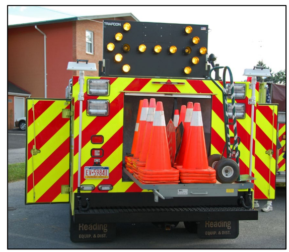
Figure 20: Gettysburg (PA) FD Fire Police unit with compartment doors open to show high visibility markings inside the doors).

Retroreflective striping can be used to make the blocking vehicle more visible by outlining its full shape, the inside of compartment doors (for visibility when they are open) and rub rails. Striping can be configured as an arrow to also function as a directional to oncoming traffic for which way to flow around the incident.