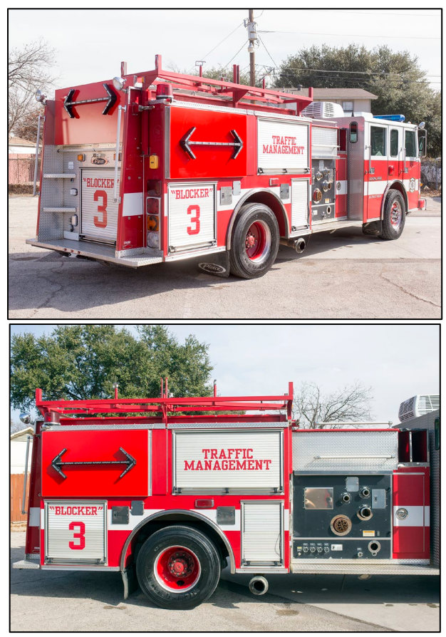
Figure 3: Views of Irving Fire Department "Blocker" 3.

The retiring pumpers are stripped of all their firefighting equipment and turned into traffic incident management units used for the sole purpose of blocking. The tanks remain and are filled with water for weight and ballast. Large, amber traffic arrow boards are installed on both sides of the trucks and on the rear. They cost about $3500 and can be moved to another unit if the current unit is totaled or taken out of service. The large arrow devices on the sides of the units help drivers approaching an incident to see the unit from a distance when it is parked on an angle as a blocking unit. Traffic control equipment, including cones, flares, oil absorbent, and brushes are carried on the blocking units as backup supply for units working the scene.