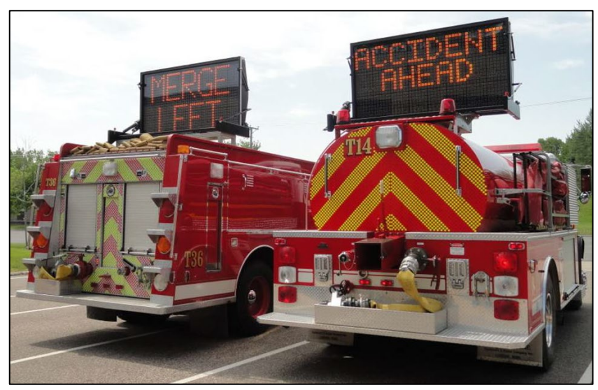
Figure 14: Message boards high-mounted at the top of Inver Grove Heights (MN) Fire Department apparatus. Highest level of effectiveness.

Also, the group expressed a desire for message and arrow boards to be designed to be rotated so they can be used on vehicles that provide angled blocks. Rotation could be achieved by separate control or by mounting on a ladder truck turntable, as the Calgary (Canada) Fire Department has done. Finally, the group agreed that the commonly used four-corner light pattern on arrow boards is not as effective at getting drivers' attention as the dancing diamonds flash pattern.