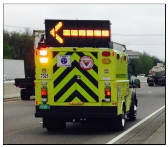
Figure 5: Rear view of a Tennessee Department of Transportation Safety Service Patrol Vehicle, with roof-mounted message board deployed.

These HELP units are response vehicles that also must function as blockers. Thus, the vehicles are equipped with traffic control devices, including 30 cones. Operators are trained to limit their exposure when setting cone tapers. Operators are also aggressive about "move it or work it" and are proactive about getting vehicles off the roadway to a safer location as quickly as possible.