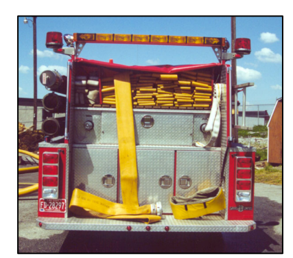
Figure 13: Larger arrow stick highmounted above the hose bed on a Lionville (PA) Fire Company engine. Moderate level of effectiveness.