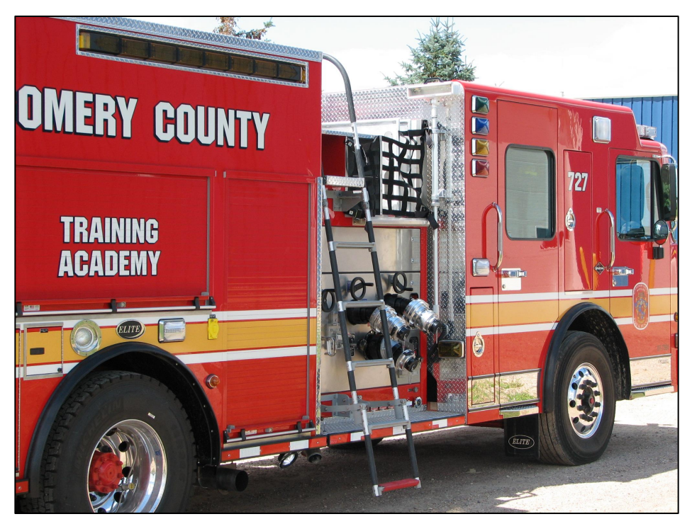
Figure 17: Montgomery County (MD) Fire Rescue engine with an arrow board on the side (top left; not illuminated). Note that the engine also has DOT reflective tape on the rub rail.

In another innovation, Montgomery County (MD) has placed arrow sticks on the sides of their fire apparatus where the arrow is more visible to traffic as it approaches a unit blocking on an angle.